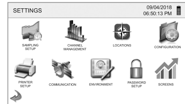
Icon Driven Menus for Ease-of-Use